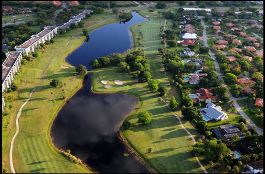
3051 S Palm Aire Dr APT 201, Pompano Beach, FL 33069