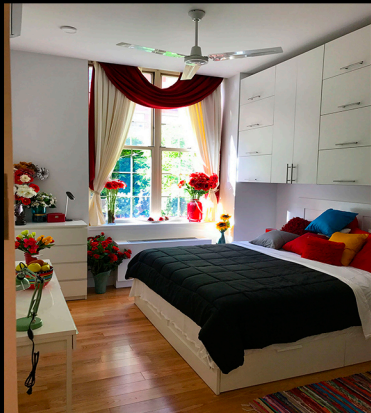
Master bedroom overlooking garden