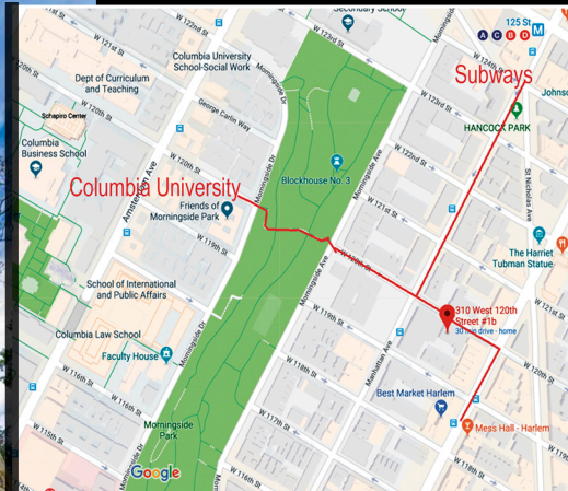
310 west 120 - condo 1B

One block to Morningside Park, Starbucks, Rite-Aid, and Best Market and new Whole Foods grocery store walking distance. Columbia University Just four blocks away. The A, C, B, D Trains are three blocks away with all Columbus Circle has to offer just one short stop on the express!