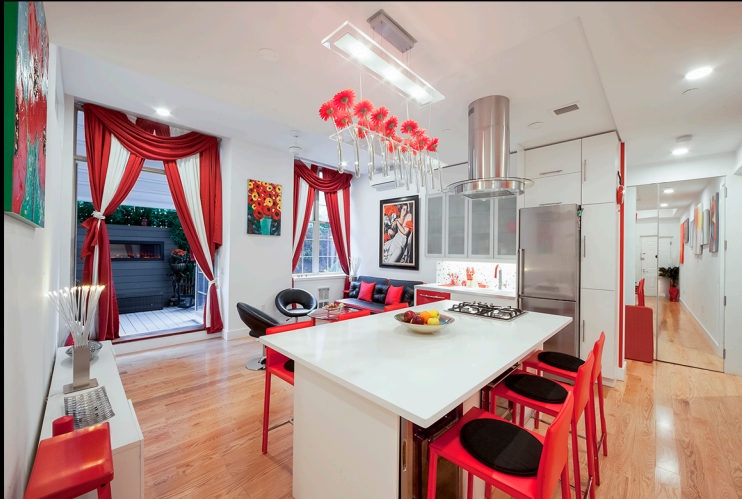
Livingroom with french door to garden/ fireplace