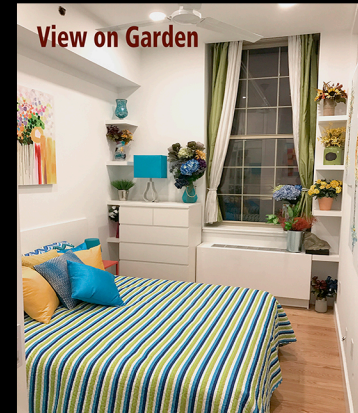
Guest Bedroom with view on garden